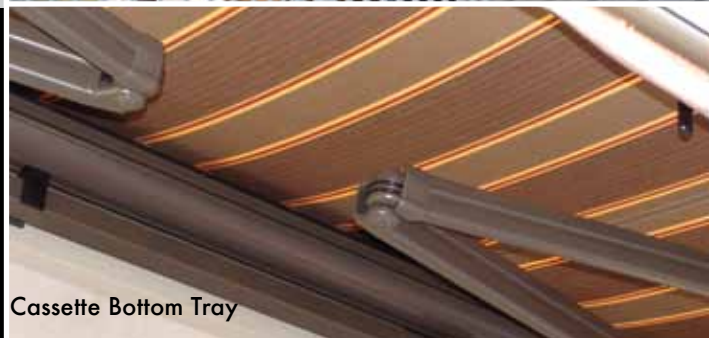
Cassette Bottom Tray