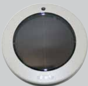
Wireless Sun Sensor