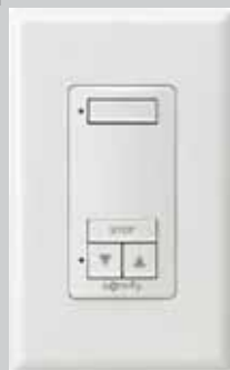
Wireless Wall Switch