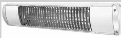
Somfy Infrared Heater

Durasol incorporates state-of-the-art UL listed and CE approved motors and electronics from Somfy, the industry leader, as well as American Heritage™. Durasol offers a 5 year warranty on all motors and electronics. Your Durasol dealer will work with you to design a shading solution that allows for a one touch wireless control to fully automated functionality.