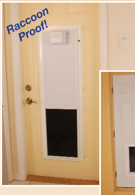
Left Photo: Inside view of electronic pet door.